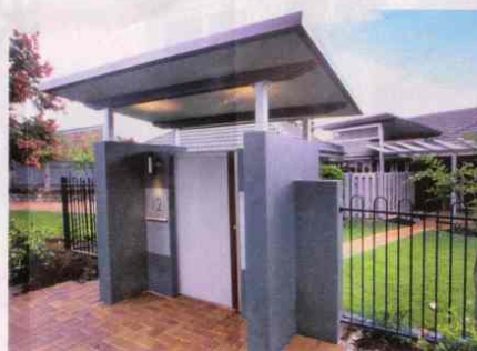
A brave new front