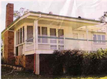
A post-war Cinderella